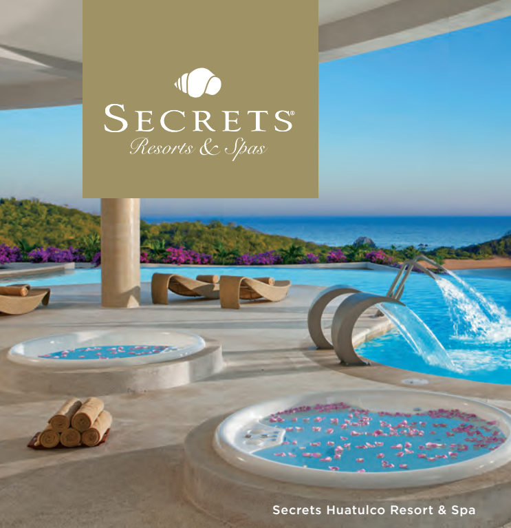
Secrets Huatulco Resort & Spa