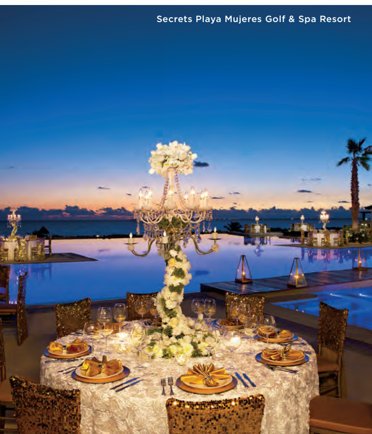
Secrets Playa Mujeres Golf & Spa Resort