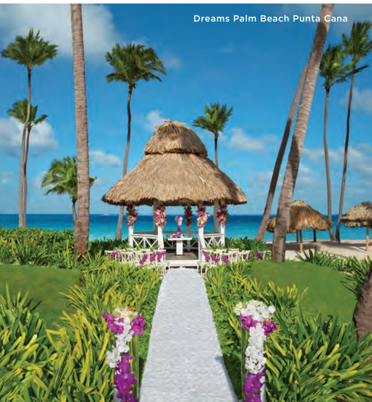
Dreams Palm Beach Punta Cana

Exchange vows under a white-pillared gazebo or by the water’s edge and have your reception under the stars on a secluded terrace or in the privacy of one of the gourmet restaurants — closed for your event. Dreams Punta Cana , Dreams Sands Cancun , Dreams Vista Cancun , Dreams Macao Beach Punta Cana , and Dreams Acapulco offer a variety of ceremony and reception locations to fit your style.