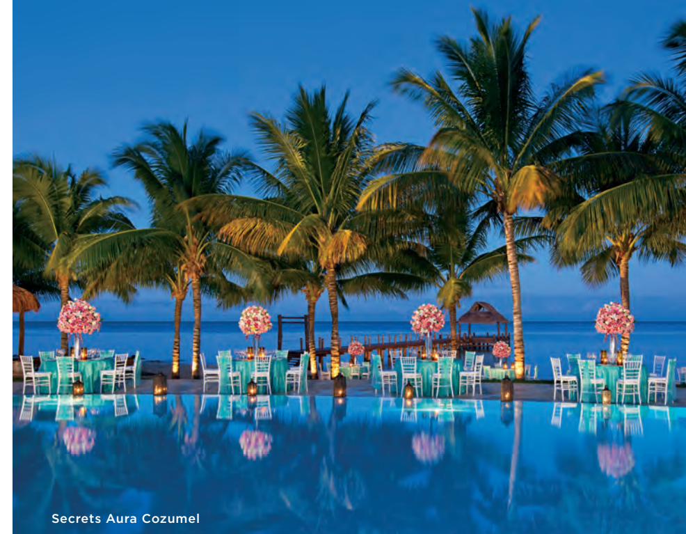
Secrets Aura Cozumel

The gazebo at Secrets Huatulco Resort & Spa is the picture perfect setting — unique and captivating — just like your love. Toast to your future at Secrets The Vine Cancun , with sommelier-led tastings and a selection of wine sure to delight even the most refined palates. Ignite a spark of adventure scuba diving along the Great Maya Reef, the jewel of the Caribbean and the second largest in the world, at Secrets Aura Cozumel .