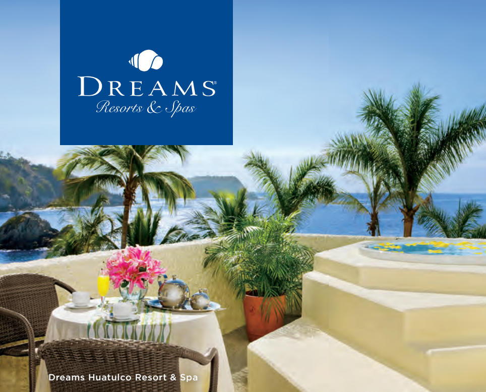
Dreams Huatulco Resort & Spa