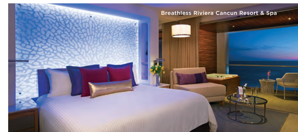
Breathless Riviera Cancun Resort & Spa