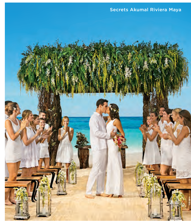
Secrets Akumal Riviera Maya

Secrets Cap Cana Resort & Spa brings the highest level of luxury and relaxation for couples with crystal blue waters and the magnificent sugar-sand Juanillo Beach, one of the Dominican Republic's most beautiful beaches.