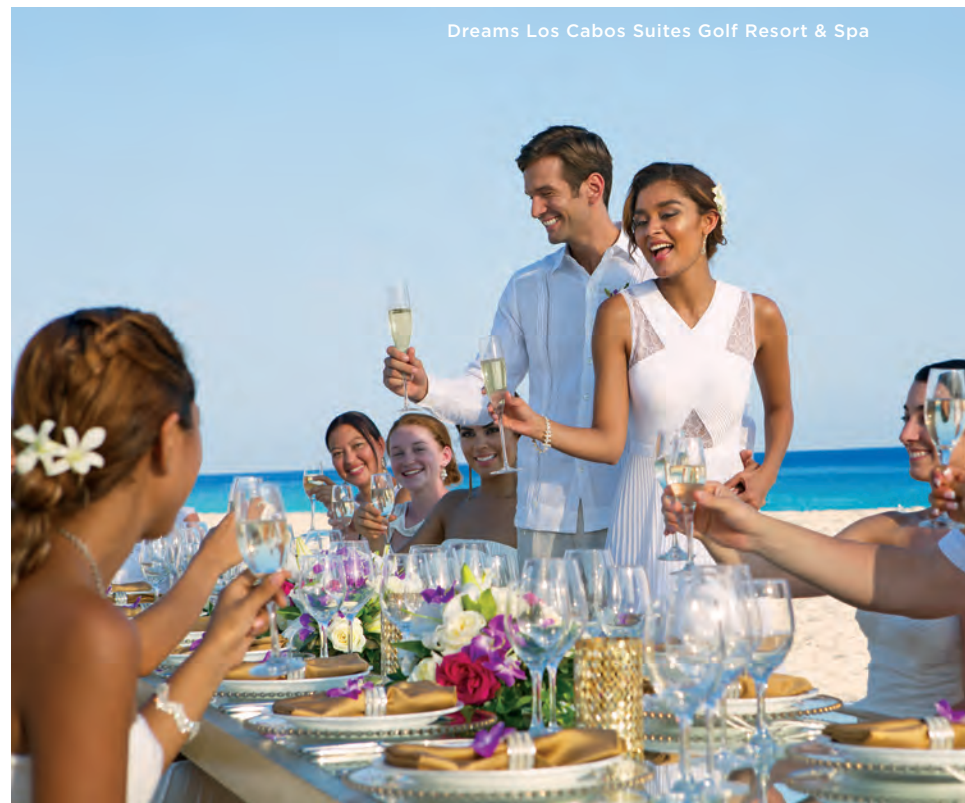
Dreams Los Cabos Suites Golf Resort & Spa