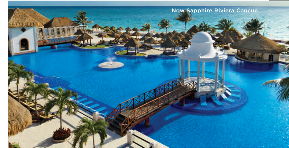
Now Sapphire Riviera Cancun