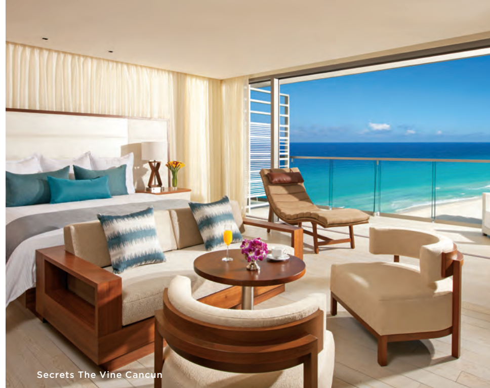
Secrets The Vine Cancun