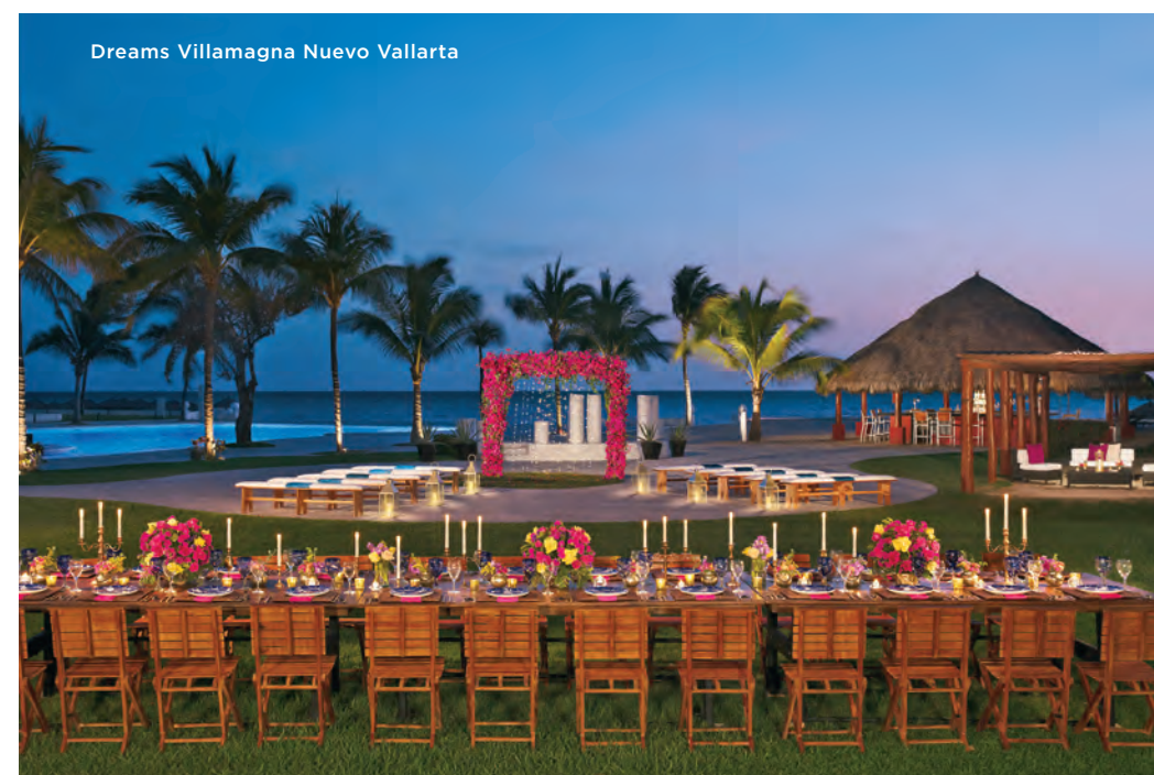
Dreams Villamagna Nuevo Vallarta

Delight in the Unlimited Luxury ® experience, where everything is included. You’ll be privy to gourmet dining at several à la carte restaurants, premium brand beverages at lively bars and lounges as well as 24-hour room service. Get your heart pumping with activities like kayaking and catamarans, or during jaw-dropping nightly entertainment such as the fire dancer show.