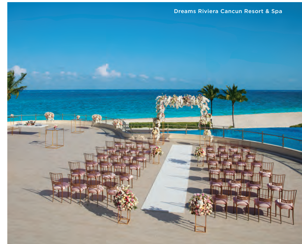
Dreams Riviera Cancun Resort & Spa

Incorporate the culture of the destination into your wedding with special touches like holding your ceremony under the Mayan inspired gazebo at Dreams Riviera Cancun . Add the music of a Caribbean trio to your cocktail hour at Dreams Palm Beach Punta Cana . Imagine the backdrop of your day surrounded by lush tropical jungles at Dreams Las Mareas Costa Rica or Dreams Playa Bonita Panama . Or infuse the island’s Dutch culture at the vibrant Dreams Curaçao Resort, Spa & Casino .