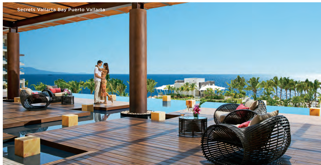
Secrets Vallarta Bay Puerto Vallarta

8 Secrets Weddings & Honeymoons | SecretsResorts.com