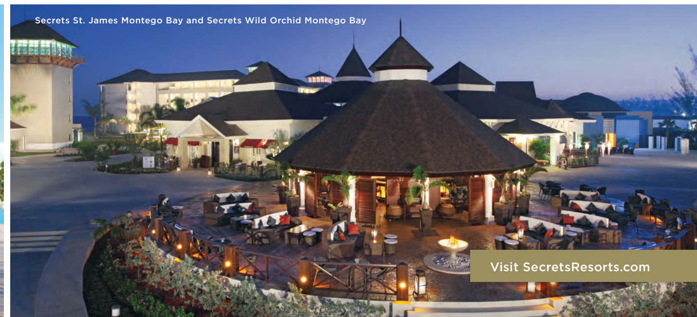
Secrets St. James Montego Bay and Secrets Wild Orchid Montego Bay