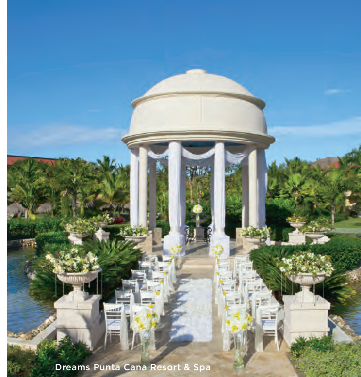
Dreams Punta Cana Resort & Spa

For full wedding bliss, check out the Preferred Club Paramount Suite at Dreams Playa Mujeres Golf & Spa Resort , ideal for couples celebrating their wedding or special occasions.